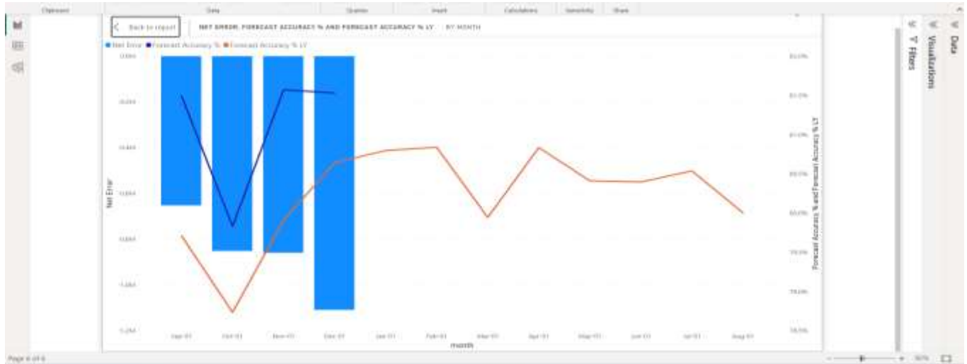
Fig 3: MAPE view on the dashboard

forecast accuracy can be done using various formulas. One commonly used formula is the Mean Absolute Percentage Error (MAPE). The MAPE formula calculates the average percentage difference between the actual values and the forecasted values. MAPE = (1/n) * \sum(|(Actual - Forecast)/Actual|) * 100 , Where: n=represents the number of data points or observations, Actual is the actual value, and Forecast is the forecasted value (Ref Figure 3).